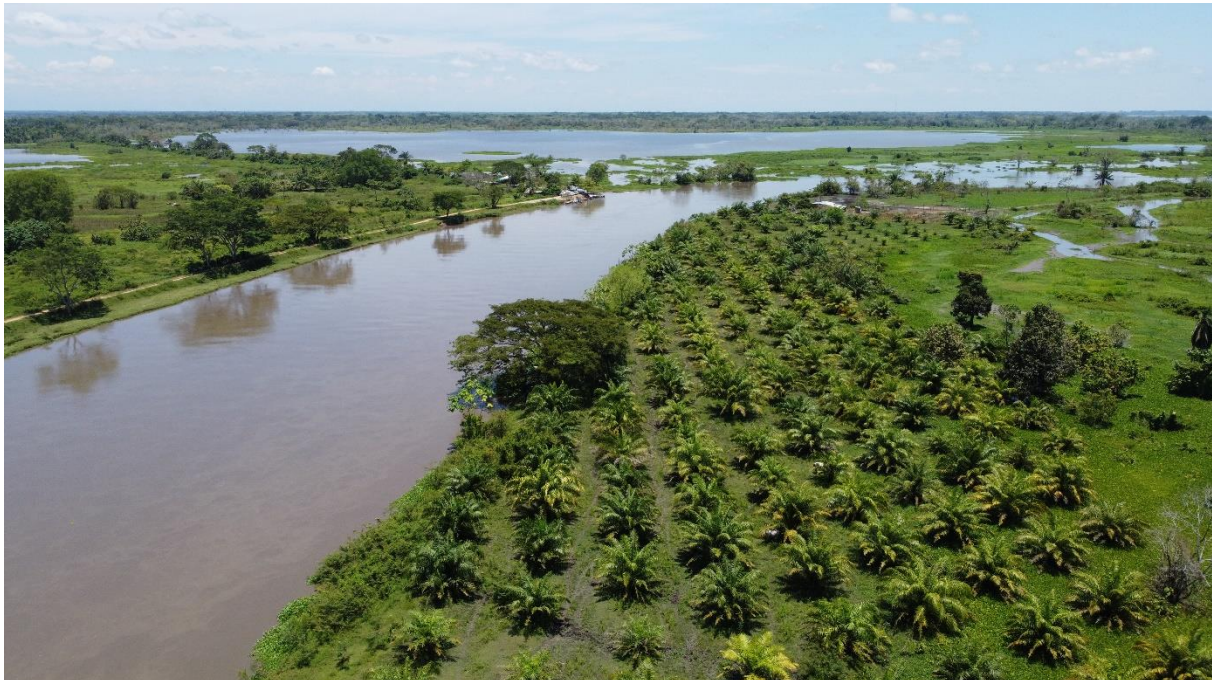
View of bodies of water in the Magdalena Medio, Santander, Colombia, 2022

Wetlands of International Importance (Ramsar sites) in the Americas. 40 Latin America and the Caribbean is one of the regions where a more widespread deterioration in the state of these ecosystems has been reported. 41