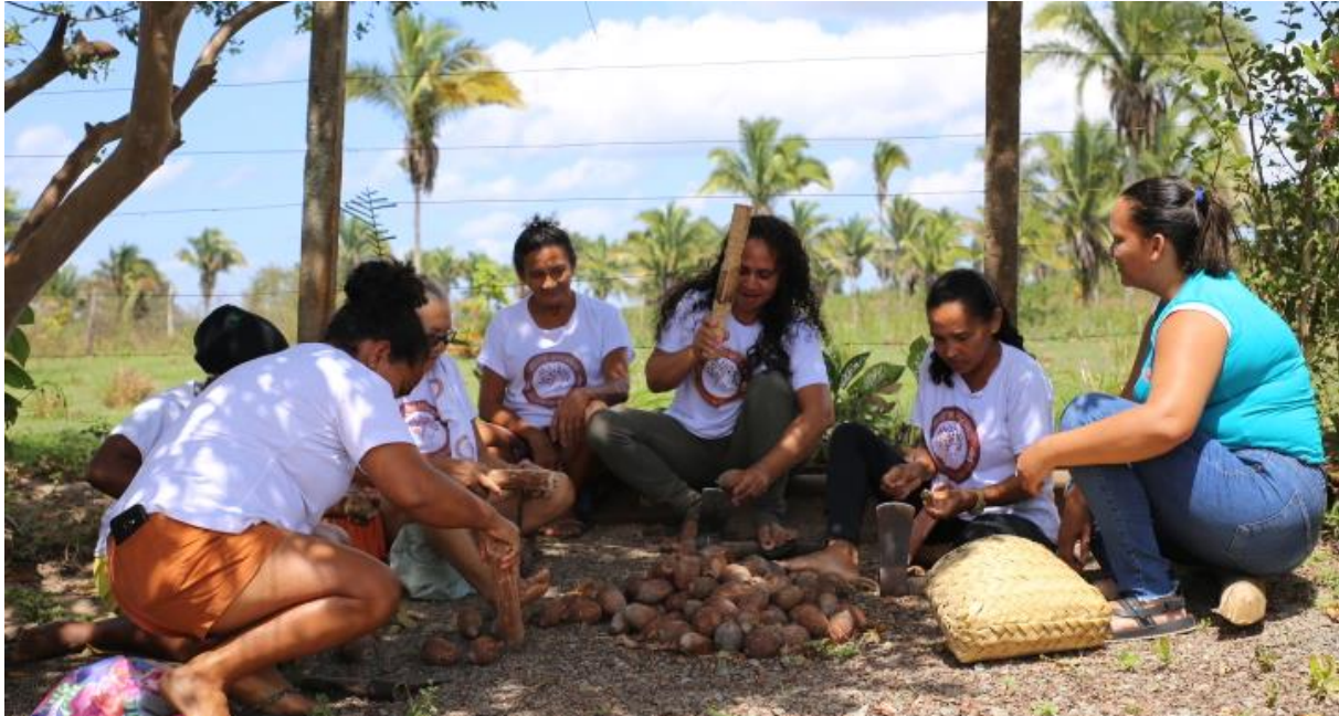
Members of the Maranhão Women's Network breaking babassu coconuts, 2023

The Maranhão Women's Network (Rede Mulheres do Maranhão, RMM) cooperative is made up of 15 communities located along the Carajás railway line. 185 The network is coordinated by 12 women and 15 business associations, benefiting a total of 200 women from the region. Among them, there are four groups of coconut breakers who extract the coconut flesh and several factories producing oil, soap, sweets and other products from the coconuts.