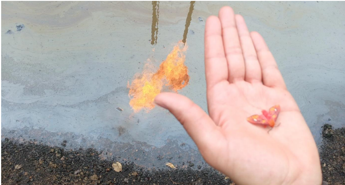
The hand of one of the young women activists holding up an insect against a gas flare

In 2020, a group of nine Ecuadorian child and teenage girls filed a habeas corpus petition 125 against the annual State permit allowing the operation of gas flares – the burning of gases associated with oil extraction – 126 in the Ecuadorian Amazon provinces of Sucumbíos and Orellana. The petition was filed together with the strategic litigation organization Union of People Affected by Texaco Operations (UDAPT).