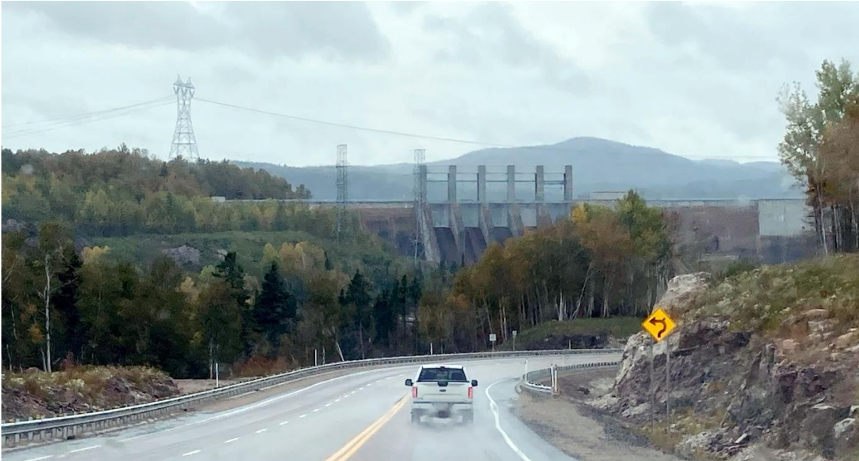
View of a dam in the Pessamit reserve, 2022

Pessamit is an indigenous community of the Innu Nation, located in the Côte-Nord region of the province of Quebec, Canada, at the mouth of the St. Lawrence and Betsiamites Rivers. 211 The reserve, as defined by the Indian Act, 212 covers an area of approximately 256 km 2 and has a population of about 4,000 people. 213 However, the Innu's ancestral territory, the Nitassinan, is much larger, spanning around 138,000km 2 . The Innu have never ceded this territory to either the federal or the provincial governments. In 2005, the Pessamit community began legal proceedings to formally claim their ancestral territory. 214