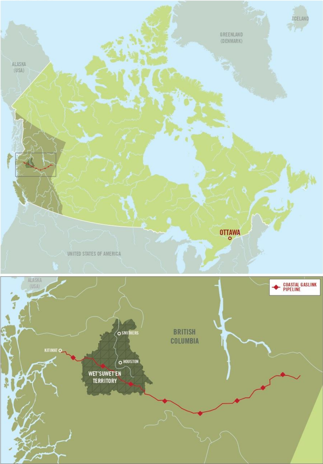
Map prepared by Amnesty International.