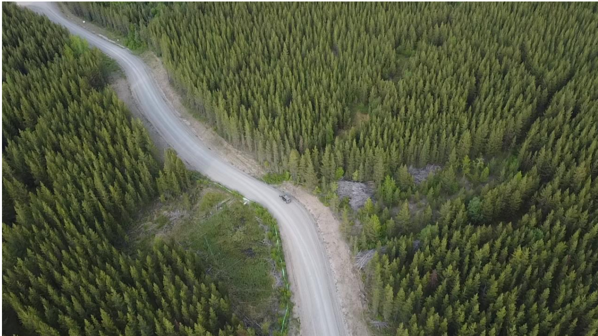
View of Wet'suwet'en territory, 2023

Fossil fuel companies, whether state or private, play a key role in the emissions that drive global warming. According to the Carbon Majors database, 100 existing fossil fuel companies (and eight that no longer exist) have produced almost a trillion tons of GHG emissions in 150 years – more than half of all emissions since the industrial revolution. These 100 companies are responsible for 71% of all GHG emissions since 1988. 10 In the Americas, the private companies responsible for the most emissions during this period, according to the database, are from the United States: ExxonMobil, Chevron and Peabody. The largest emitter amongst state-owned companies in the Americas is Mexican company Pemex, followed by Venezuelan company Petróleos de Venezuela, S.A. 11