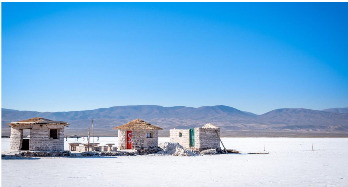
Salinas Grandes, Jujuy, Argentina, 2018

The Kolla and Atakama nations and peoples have lived and cared for the territory of the Salinas Grandes basin and the Guayatayoc Lagoon for generations, with a population of around 7,000 people spread over 33 communities. Twenty-two of them are located in the province of Jujuy and the rest in the province of Salta, in northwestern Argentina, in the part of the altiplano known as Puna, near the border with Chile and Bolivia. 230 Their cosmivision includes an intimate and spiritual relationship with their ancestral territory, which is not only the source of their livelihoods, but also an inextricable part of their history, culture and identity. 231