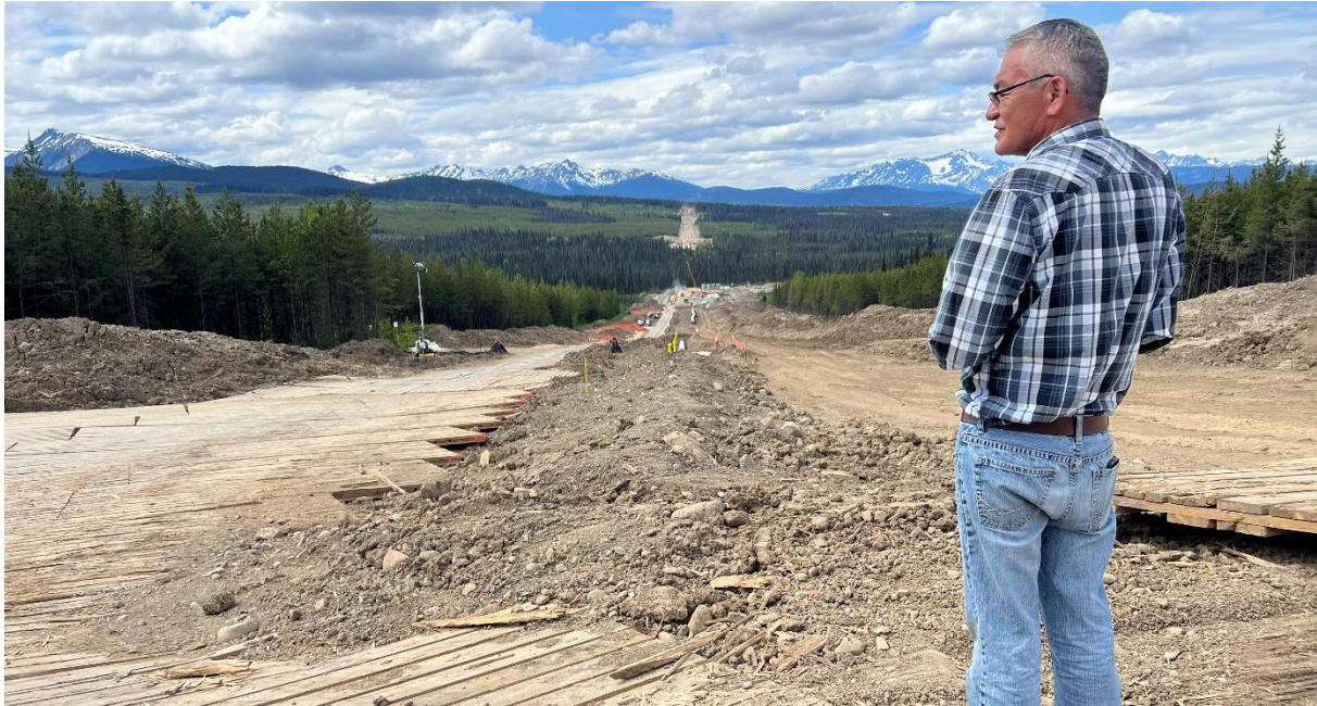
Chief Na'moks of the Wet'suwet'en hereditary chiefs on a building site, 2023

The traditional territory of the Wet'suwet'en nation is divided into five clans – Gilseyhu, Laksilyu, Gitdumden, Laksamshu and Tsayu – and 13 groups of matrilineal house groups. Collective decisions are made through the feast system, which remains central to Wet'suwet'en government, law, social structure and world view. 143 The Wet'suwet'en have never sold, surrendered or in any way relinquished their collective title to their territories. They have continued to exercise their unbroken, unextinguishable and unceded right to govern and occupy their lands. Hereditary chief Gisday'wa stated that “our territory, our river and our mountains are sacred to us”. 144 Other members of the nation stated that “[our territory] is part of who we are as an Indigenous People” and that “the Wet'suwet'en do not own the land; we are simply caretakers for the next generation. We have a duty to the land, the animals, the water, everything that sustains us. The Earth can survive without us, but we cannot survive without the Earth”. 145